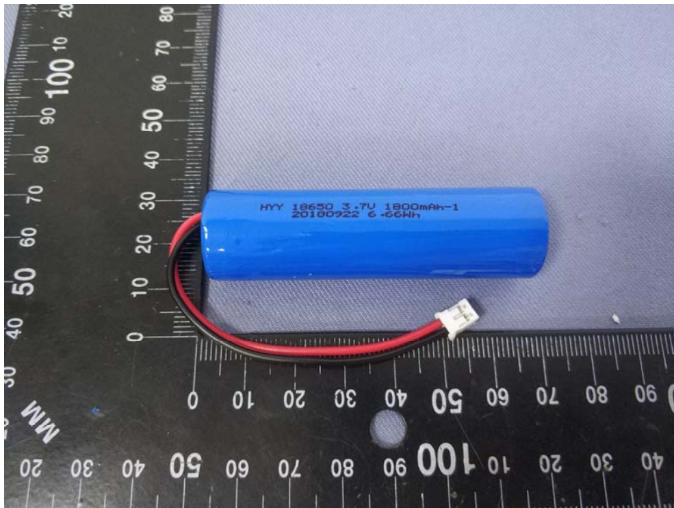
Figure 1 Top view of battery