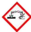
Serious Eye Damage

H225: Highly Flammable Liquid and Vapor H315: Causes skin irritation H332: Harmful if inhaled H336: May cause drowsiness and dizziness